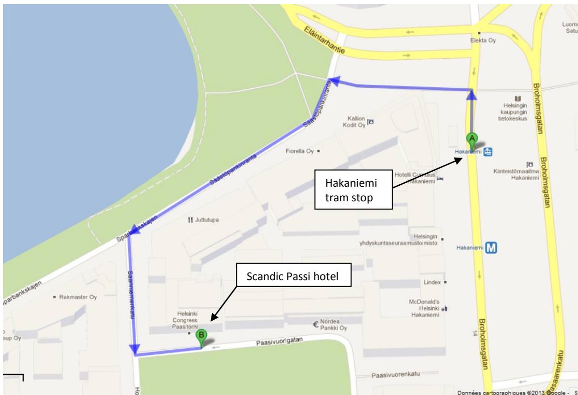
Figure 2: Location of Scandic Paasi Hotel Helsinki

An individual room can be cancelled without costs until 6pm on the date of arrival.